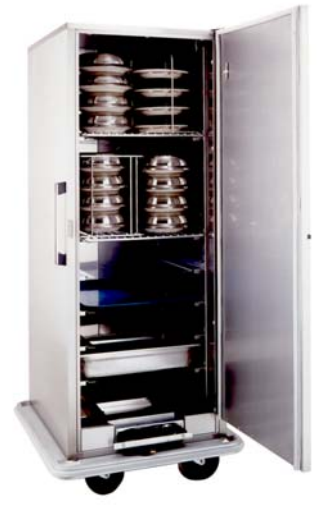
BB1864 Banquet Cart

*For food safety reasons, it is recommended that the food be held at 140°F or higher.