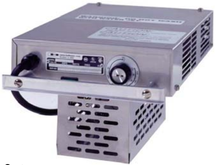
FH90 Heating System